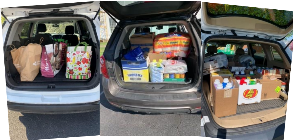
Pictured above, donations for Betty Lou's packed several vehicles.